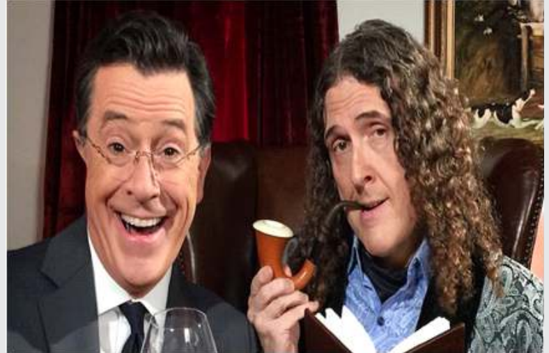
Weird Al Yankovic performing, "Word Crimes" on the Stephen Colbert show in Smoky Joe's grey and black paisley jacket.