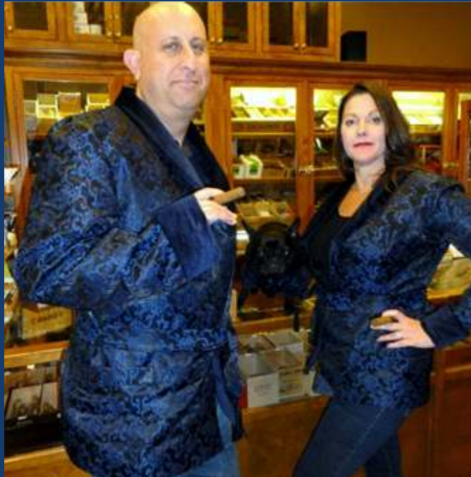
Blue Brocade Jackets with Black Velvet Lining and Bemberg Lining