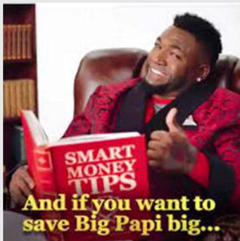
David Ortiz (Big Papi) wearing a Smoky Joe's Brocade Jacket.