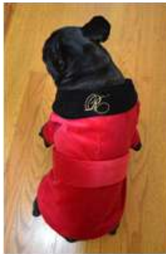
Berry Velvet Jacket with custom embroider collar