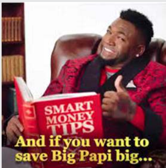
David Ortiz (Big Papi) wearing a Smoky Joe's Brocade Jacket.