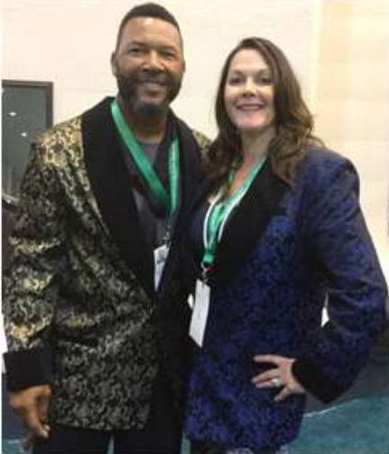
Former National Baseball Player, Gary Sheffield wearing a black and gold smoking jacket with Beth Stern in a Women's blue brocade smoking jacket.