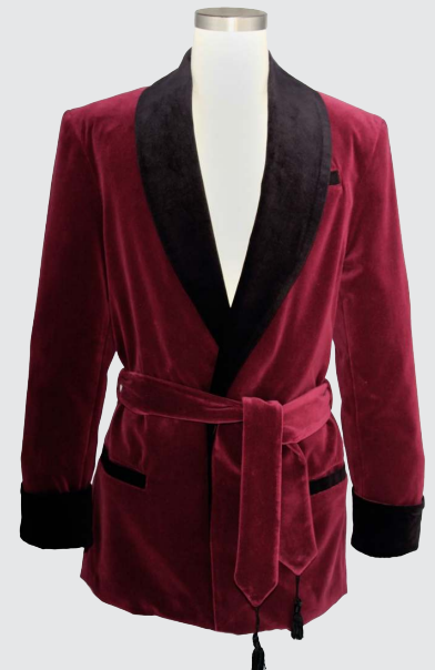
Wine Velvet Jacket with Black Velvet Cuff and Collar