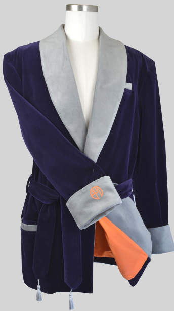
Custom Purple and Grey Velvet Jacket with Orange Silk Lining. Initials on Right Cuff.

Our smoking jackets and accessories are made of velvets, brocades, cottons, faux fur, cashmere, alpaca, silks and bembergs. We have a large selection in our Chicago warehouse which can be purchased directly from e-commerce store. If you wish to create your own jacket we have a large selection of fabric colors and trims on our website. Sport teams, clubs or businesses who wish to create their own unique style can contact our design team which can assist with design fulfillment. Products can be purchased through our website www.smokyjoesclothing.com or 773.998.2181 for customer service.