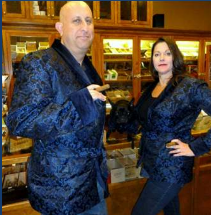
Blue Brocade Jackets with Black Velvet Lining and Bemberg Lining