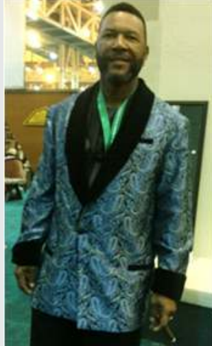
Gary Sheffield in a teal blue paisley smoking jacket.